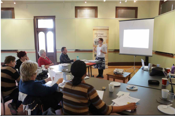
Workshop in Mackay Old Town Hall