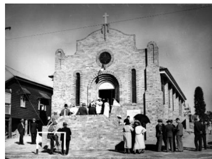
St Clement's Catholic Church, c.1937

Enquiries phone: ALHS Qld Hon. Secretary, 0400 571 387